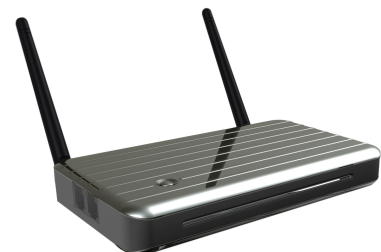
WiFi VoIP Gateway